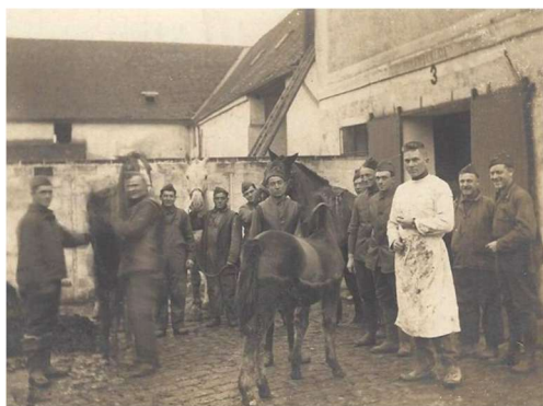
U. S. VETERINARY HOSPITAL NO 8, CLAYE SOUILLY, FRANCE, A.E.F. WW1

On August 6th, 1918, the Remount Squadron No. 302 under telegraphic instructions, from Chief of the Remount Service, Tours, France, entrained at Guer, France, and proceeded to Claye-Souilly, Seine-Et-Marne, France, reporting as instructions to 1st. Army Corps for duty.